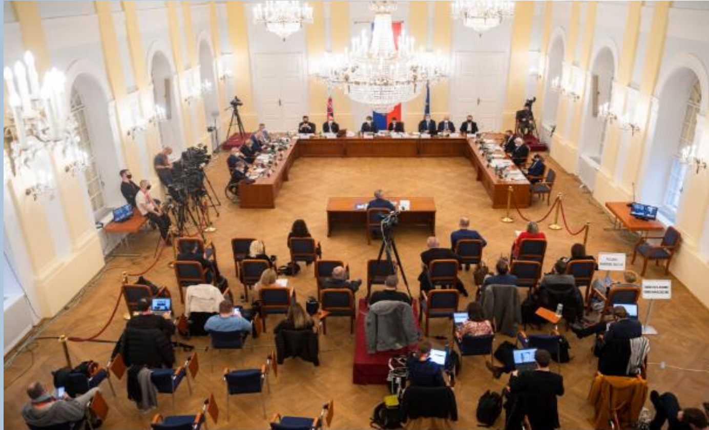
Schôdza Ústavnoprávneho výboru NR SR, ktorý vypočúva kandidátov na generálneho prokurátora SR v historickej budove NR SR na Župnom námestí.