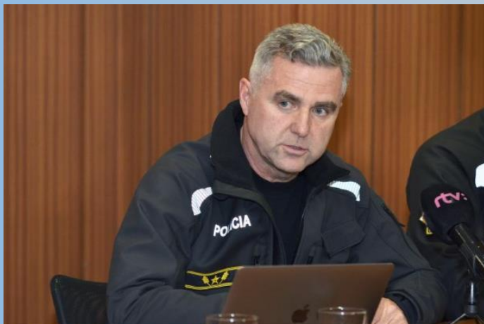
Bývalý policajný prezident Tibor Gašpar.

Ex-Police president Tibor Gašpar is currently under arrest on several criminal charges including corruption