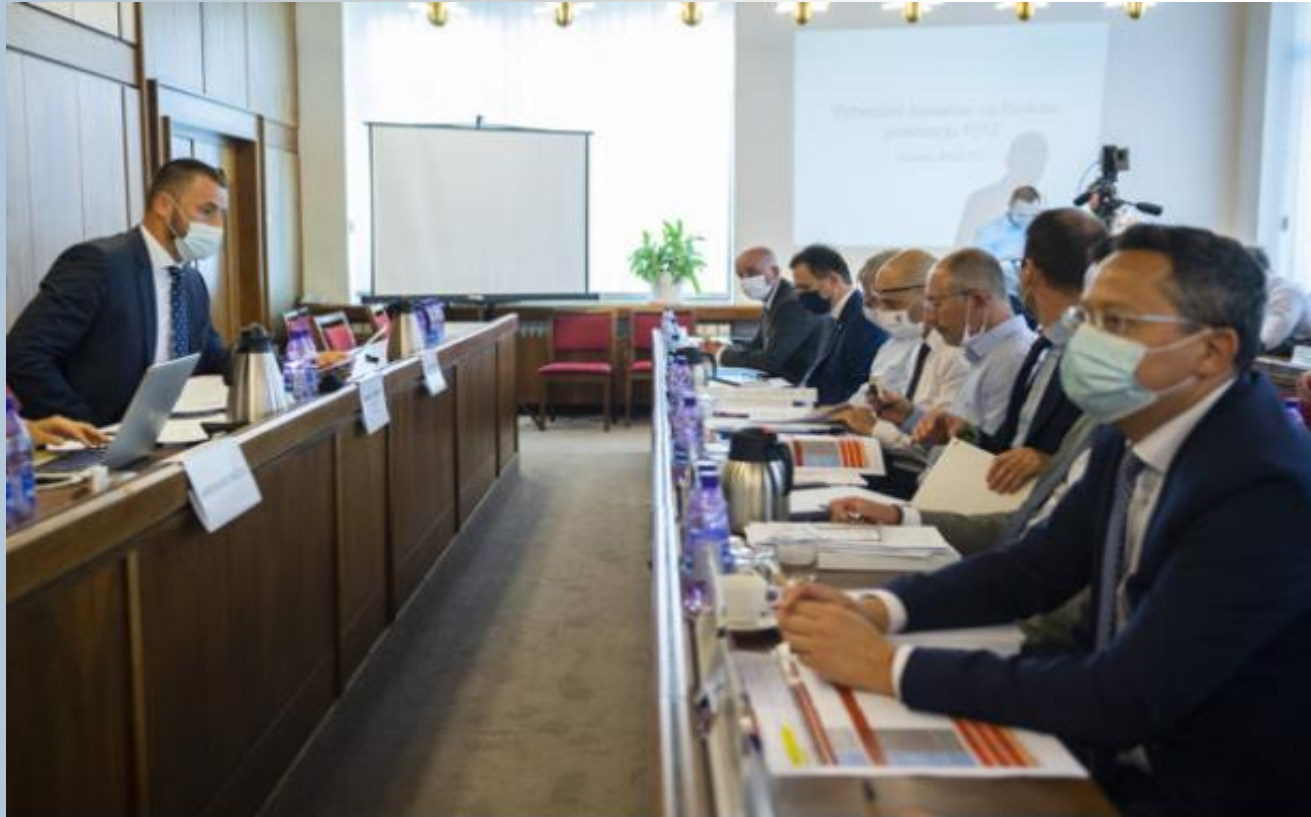
Predseda Výboru NR SR pre financie a rozpočet Marián Viskupič (SaS) a prvý správa poslanec NR SR Ladislav Kamenický (SMER) počas verejného vypočutia kandidátov na post predsedu Rady pre rozpočtovú zodpovednosť.